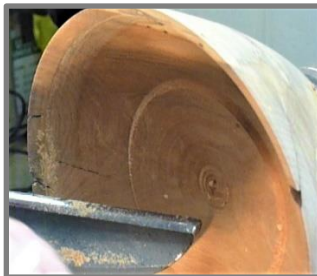
INSIDE TURNING PARTIALLY FINISHED