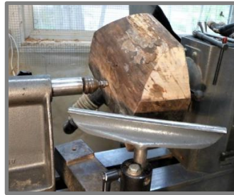
TAILSTOCK AND TOOL REST IN PLACE