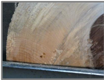
SURFACE AFTER SHEER SCRAPING