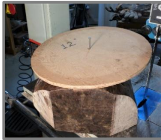
CORNERS TRIMMED OFF