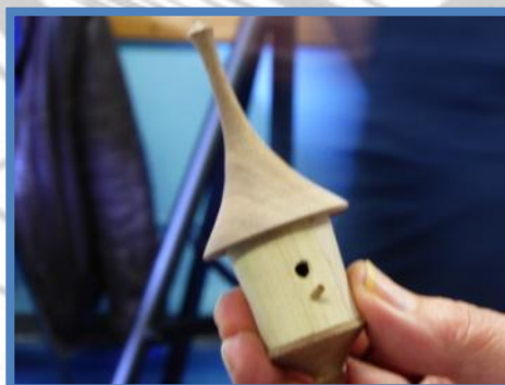
Birdhouse completed. A "mini-bird" would be happy to call this home.