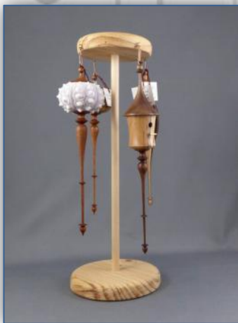
An assortment of decorations by Carl Durance