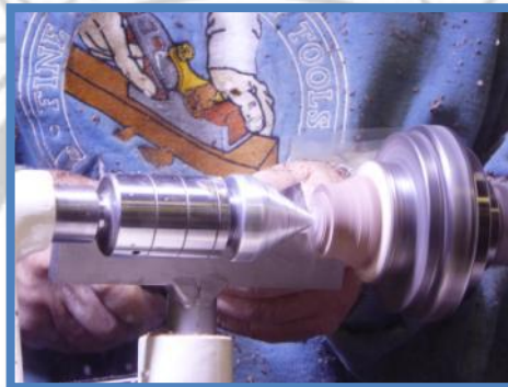
3rd part, the base. Turn tenon to fit the bottom of the birdhouse body