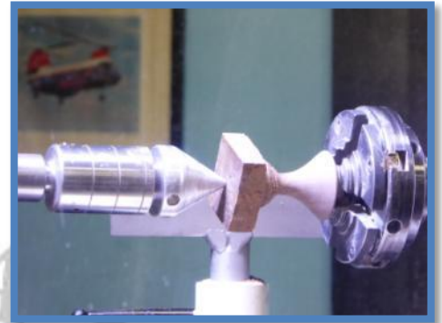
Begin working the top finial.