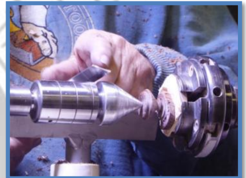
Shape the base.