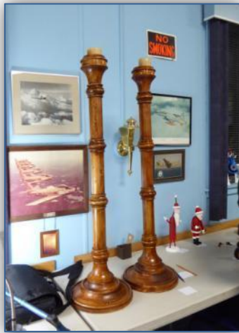
Fir candle sticks by Eric Deckert