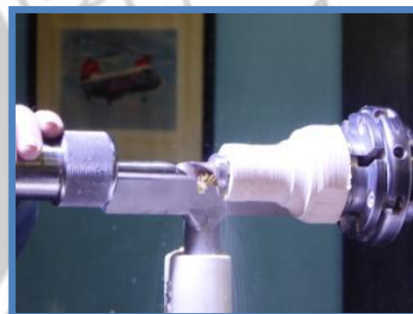
When near proper OD, use a Forstner bit to easily drill out the interior