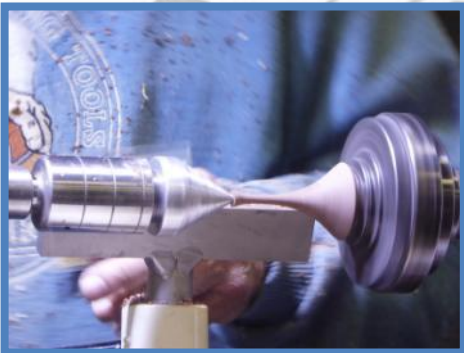
Finial/roof is complete, still to sand and finish.