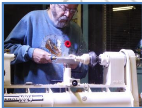
Finalize the exterior