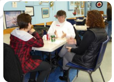
Members and guests chatting