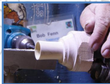
Drill "bird" entry and perch holes (actually it is better to drill these holes before the body is hollowed out).