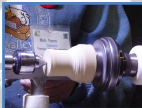
Work body to desired OD