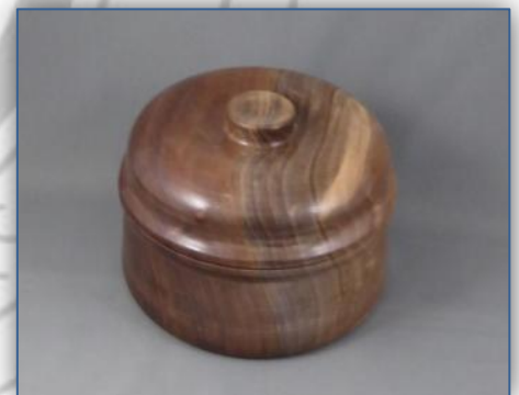
Bruce McGaulley, walnut with shellac finish