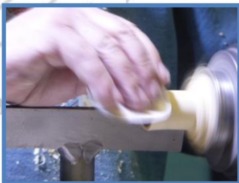
Sand the exterior, finish and part body off.