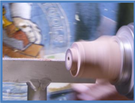
Work on the roof now. Start with a tenon to fit the body of the birdhouse.