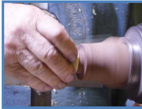
Size the tenon to fit.