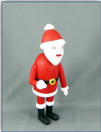
Bruce Gordon, whimsical Santa, spruce 2 x 4, acrylic paint