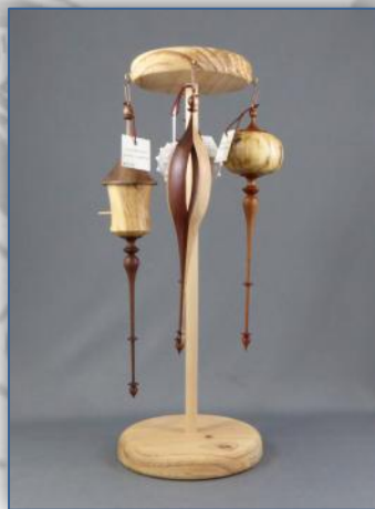
Part 2 of an assortment of decorations by Carl Durance