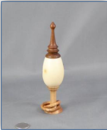
Mike Malone - tagua nut (also known as vegetable ivory), cherry and lignum. Note the interlocking rings.