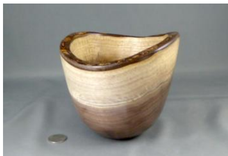
Joe Wallace, Natural edged walnut bowl with edge sanded and sealed, Tru oil finish