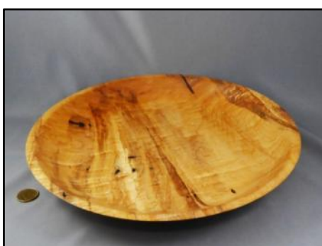
Geoff Miller, 15" OD, sugar maple, linseed oil and beeswax finish