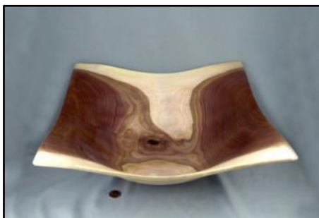
Walnut fom with bleached sapwood experiment by Doug Magrath