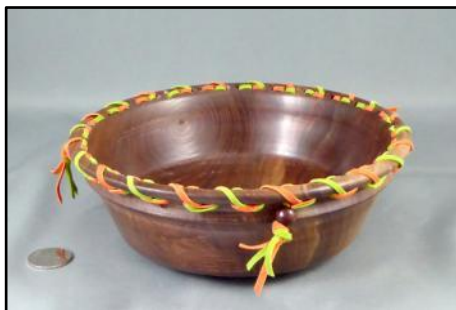
Jeanne Corey, Walnut bowl with laced rim