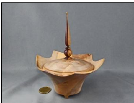
Bob Fenn, 6 cornered box (design opportunity)