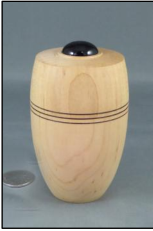
Paul Newton, Open, maple with insert and burned bands