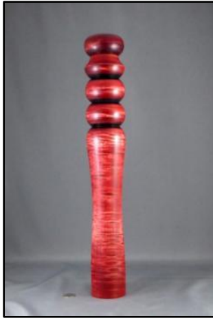
Dave Bell, a tall dyed maple pepper mill