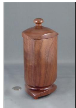
Joe Wallace, walnut with tung oil finish, Open