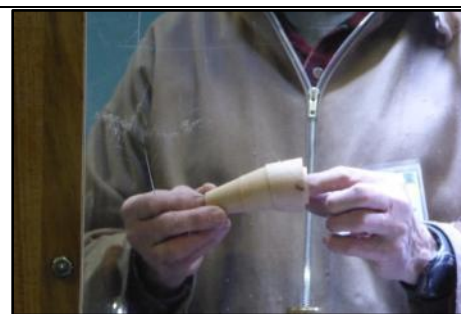
Reassembled pieces in new configuration

For more of Hosaluk’s turnings please go to http://www.michaelhosaluk.com/