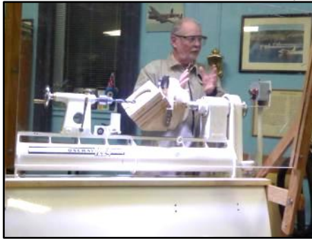
The lathe holds the “multi-axis holding” jig. It is important to stress safety and secure fastening as well as full safety gear for this type of experimental turning! If you aren’t sure don’t do it, rethink it!