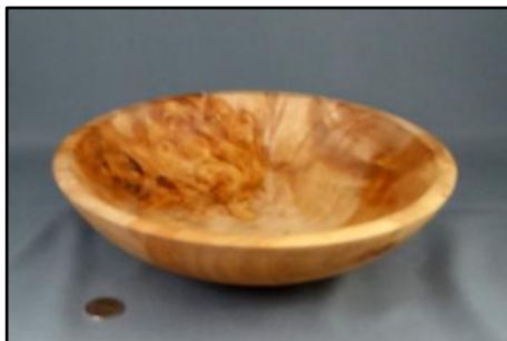
Sorry, out of focus - info unreadable