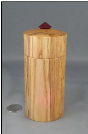
Eric Deckert, Open (See other side, next photo, which is spalted)