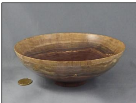
Joe Wallace, walnut, tung oil finish