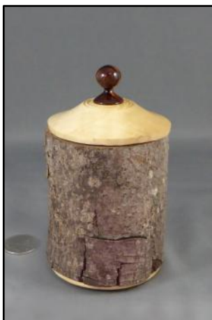
Bob Fenn, Open. Beyond natural edge to natural exterior