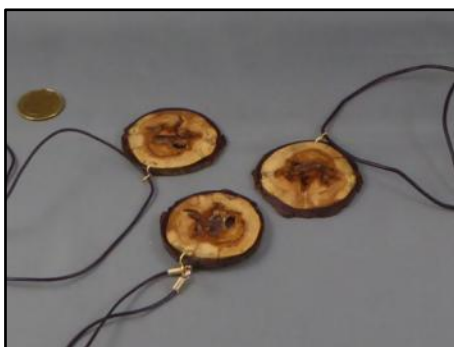
Bob Fenn, maple branch rounds make simple jewelry necklaces