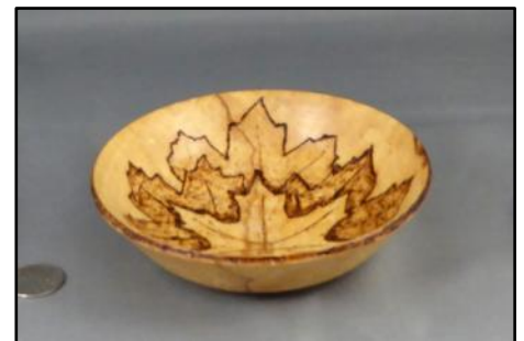
Jeanne Corey, 1st bowl on new lathe with woodburned details "Maple leaf forever"