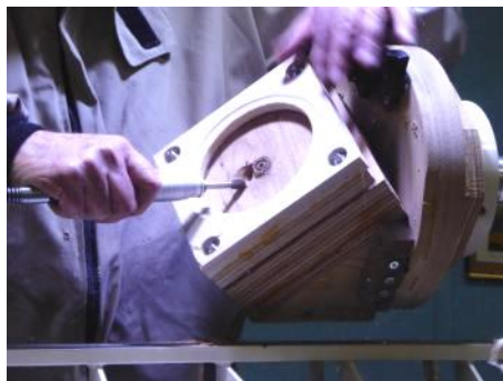
Removing wood with a Foredom grinder