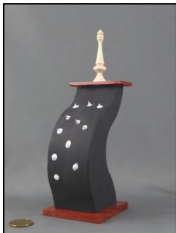
Box, but too late for last month's challenge, turner unidentified