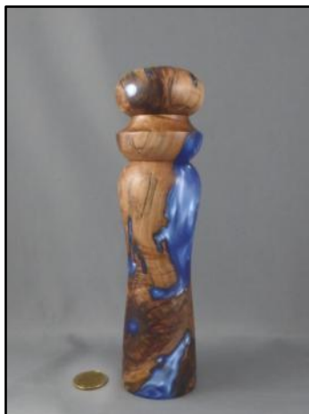
Dave Bell, maple burl and Alupalite resin salt mill, Circa 1812 and beeswax finish