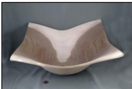
Walnut form experiment by Doug Magrath