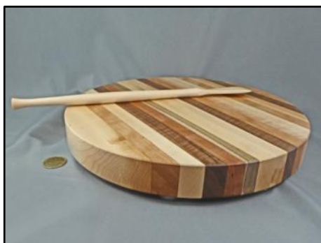
Johantan Brown, salad bowl oil, ~13" x 1 1/2 dia, various woods