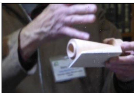
Turned portion with box cavity, ready to be sawn. Use care and use a support to lessen danger as you saw the pieces apart