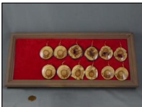
Bob Fenn, maple branch rounds make simple jewelry