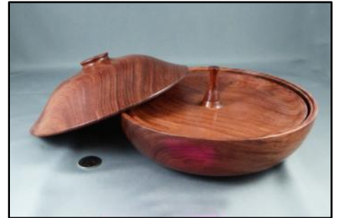
Walnut bowl with interior piece, turner unidentified