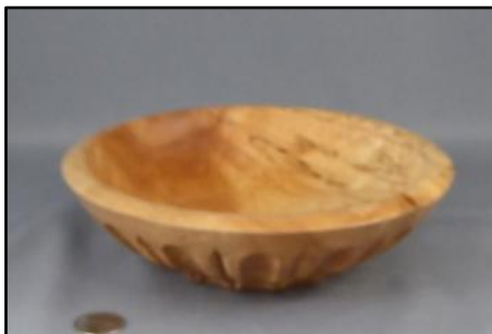
Ruby Cler, exterior fluting applied by router