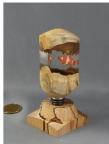
Dave Bell, clear Alupalite with small cast fish