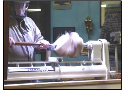
Under power there is an incredible amount of ghost image, watch your clearances!