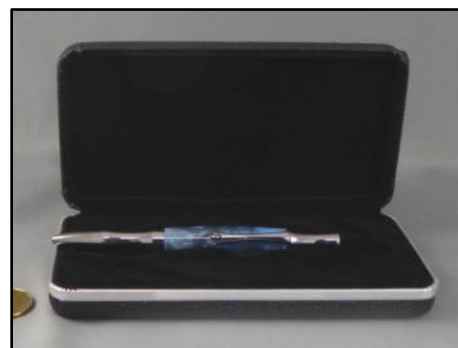
Dave Bell, pen with homecast polyester resin body