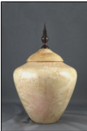
Satin smooth, turner unidentified