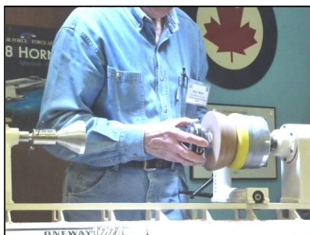
After being aligned with the tailstock cone he positions a scroll chuck. This enables him to turn a part conventionally (in-line rather than off-set)