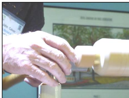
Work begins on the base of the box which from here on is conventional turning.

Gary's demo makes use of the vacuum capability that some turners have with their lathe set-up.