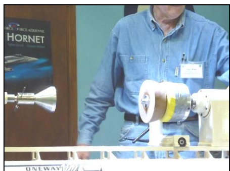
Gary's set-up using a curved shape with a threaded insert held in position by vacuum

Gary's demo makes use of the vacuum capability that some turners have with their lathe set-up.