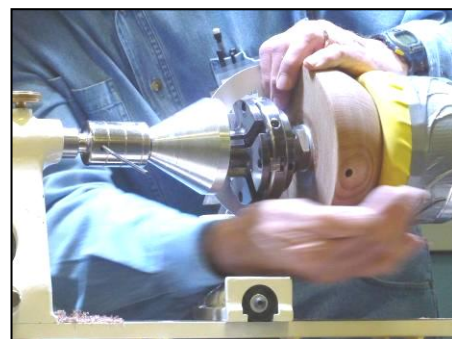
When ready to turn the offset the vacuum is released and the assembly is angled to the appropriate point and vacuum re-applied.