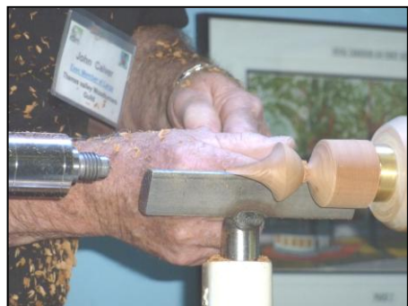
Too fast to see the wobble, but you can see the shape