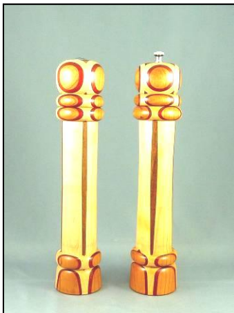
Intermediate 1 st Dan Kelly