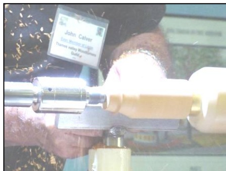
Fastened to chuck at 0° the primary turning is completed