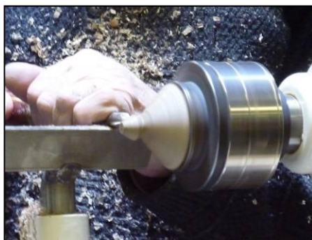
Final shaping of the roof