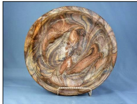
Bernie Hrytzak, rubber foam turned and marbled