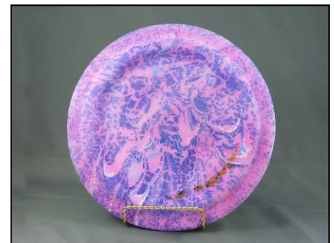
Bernie Hrytzak, rubber foam turned and marbled