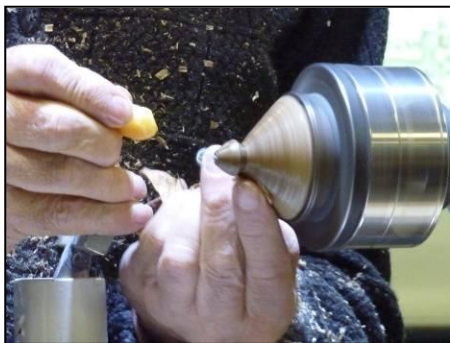
Again, application of color by pen and a carnuba wax finish