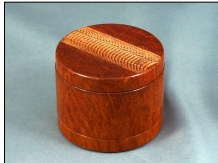
Small box with design on top – Gary Miller