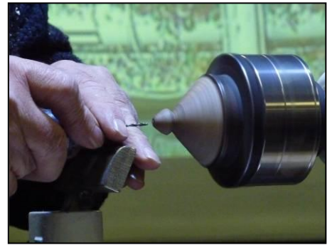
Drilling a small hole to accept a self made eye.