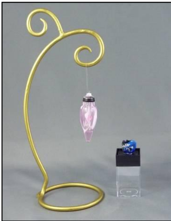
June Simpson's miniatures in acrylic