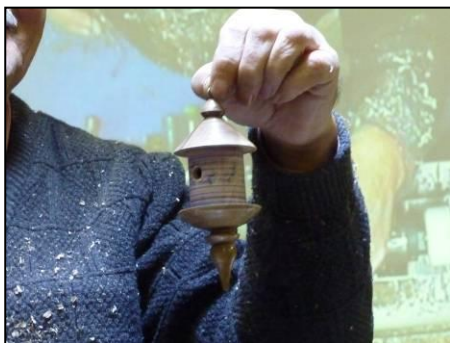
Ready for a tenant