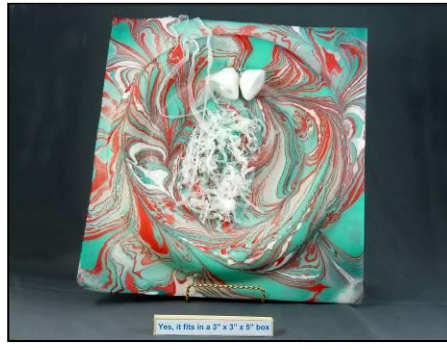
Bernie Hrytzak, Open (rubber foam approx. 10" x 10", it fits if folded)