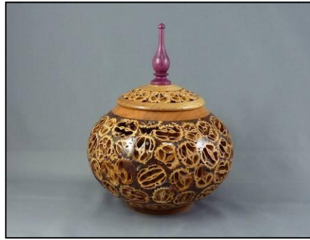
Mario Moran – walnut shells and epoxy