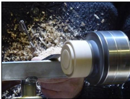
A tenon is turned in the roof block to fit the body of the bird house