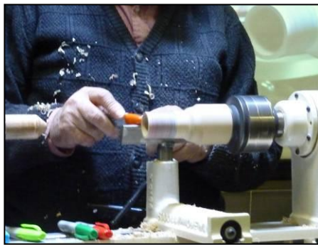
Using a colored pen he colors the body and will apply carnuba wax as a finish