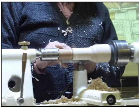
The body of the birdhouse is turned