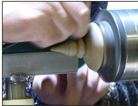
Bottom finial detail is completed and sanded before applying color and wax