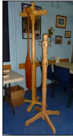
Paddle Paul Clothes tree turner unidentified