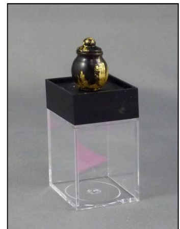
June Simpson, Open (a miniature)