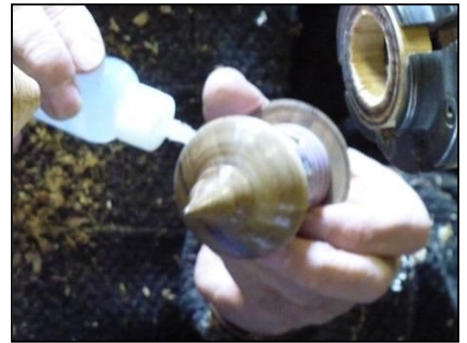
Final assembly using CA glue