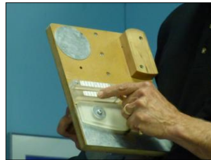
A Jig for sanding the precision flats of his bobbin