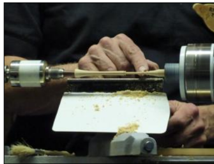
Turning Richard's unique bobbin