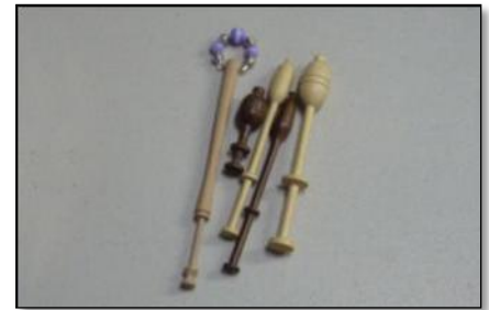
Classic European bobbins