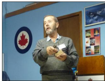
A wood faceplate made by cutting a threaded hole to match your headstock thread