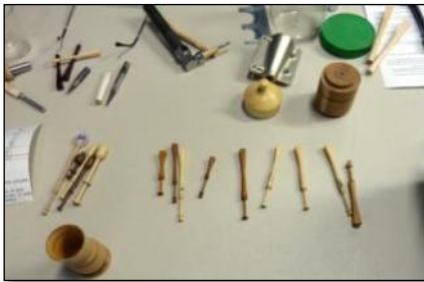
Gauges and templates made from light gauge aluminum and laminated paper