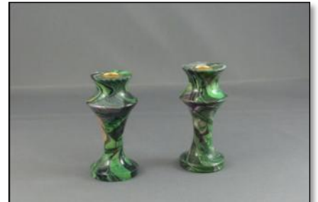
Examples of marbleizing, the topic for November's demo.