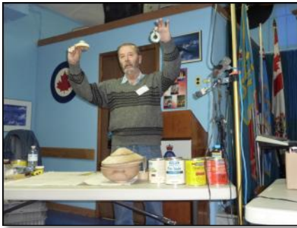
A reminder of low cost face plates using nuts and as well as bored and threaded wood faceplates Showing the thread cutting tap used