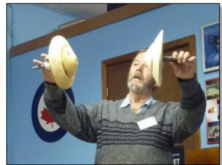
Truncated cone (frustum) for centering segment rings or as large tailstock live center