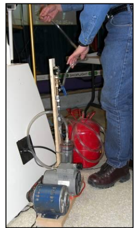
Ready to go