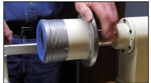
Chuck in place – note the faceplate base