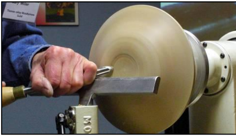
Final work on the foot