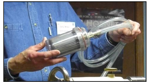
An moisture/oil trap