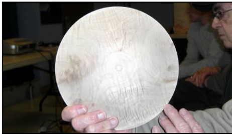
The completed bowl, ready for finish

Our thanks to Gary for a clear explanation of the materials required to build a vacuum system as well as a demo of both the gripping power of the vacuum system as well as its versatility.