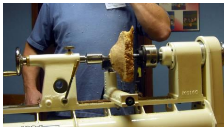
The shape is slowly worked