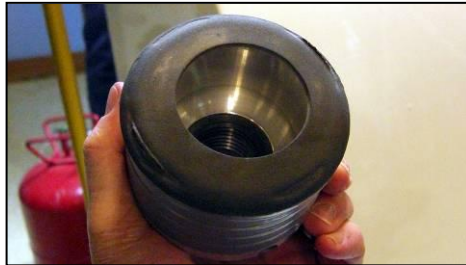
Home built Vacuum chuck