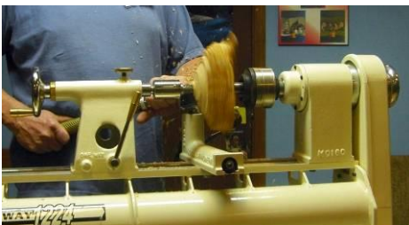
Removal of the exterior care must be taken to not contact the irregular rim