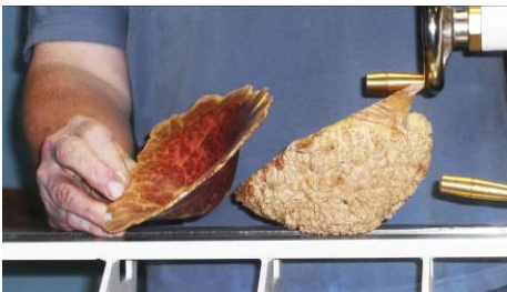
A similar type bowl showing orientation