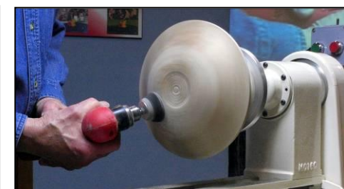
Sanding with 90 degree drill