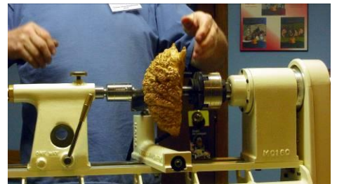
Burl is located to maximize rim