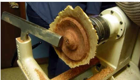
The rim is worked carefully while maintaining a solid mass of "core" to aid stability