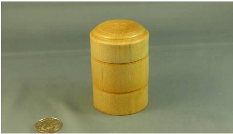
A box from the box turning seminar (turning 103)