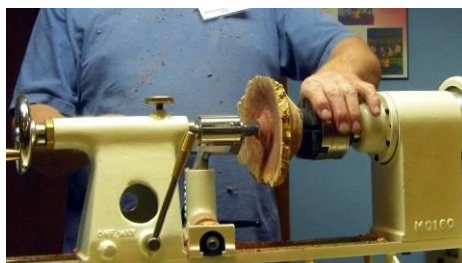
Continuing the hollowing and rim shaping