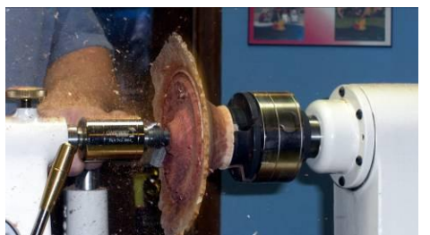
Slow and easy cuts are the order