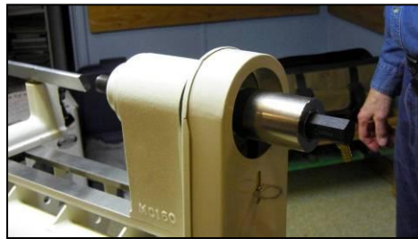
The rotating vacuum adapter