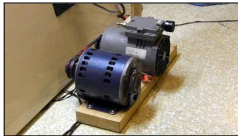
Vacuum pump and motor