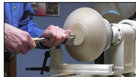
Turning foot and refining curves