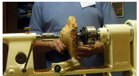
Shape is OK, now time for the inside