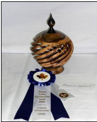
1 st Bernie Hrytzak