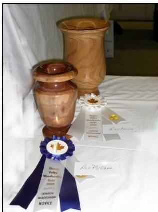
1 st and 3 rd Roy McGhee