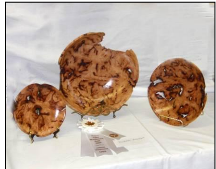
3 rd Doreen Bowden